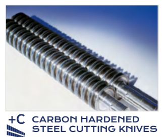
unaffected by staples and clips. Oilfree System: no need of lubrication and maintenance of cutting knives.